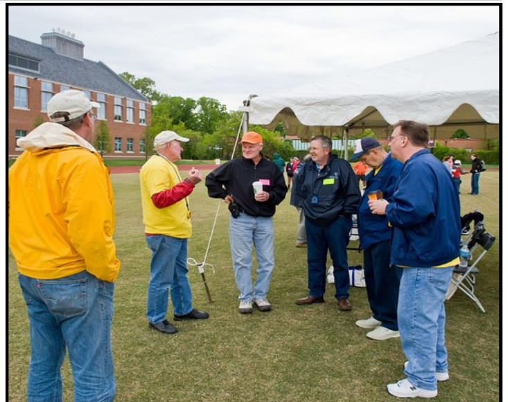
Club members helped with timing races during the Special Olympics Track Meet held on April 28th at Episcopal High School.

Capital Virginia District Third Quarter Meeting & Oratorical Contest May 18-20, 2012 Sheraton Park South