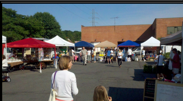
The Vienna Farmers Market opens Saturday, May 5th and continues each Saturday until October 27th.